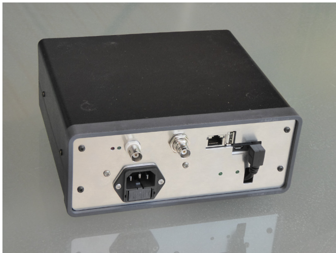
An ENAMS Receiver

At the 2017 IARU Region 1 Conference in Germany, considerable time was spent discussing EMC issues and the need for the monitoring of the RF noise floor. Two proposals emerged. The DARC (Germany) is working on developing a system that is close to the ITU-R measurement methods. They are using an active vertical antenna (active E-field probes). The receivers are based on a Red Pitaya ( https://www.redpitaya.com/ ) using different input bandwidths. Each receiver has a dynamic range of 100+dB. By applying two receivers in parallel the dynamic range is extended significantly. DARC plans to roll out 50 systems during 2019/2020.